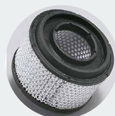
HEPA filter - optional