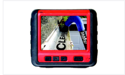
See into every corner