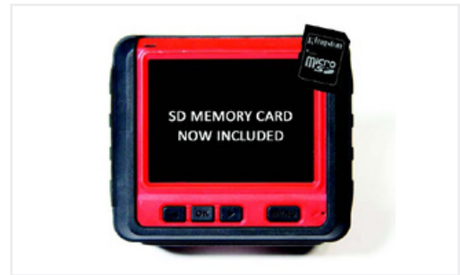
SD memory card now included