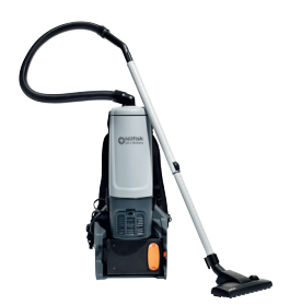
GD 5 Battery Backpack vacuum that requires no electrical connections