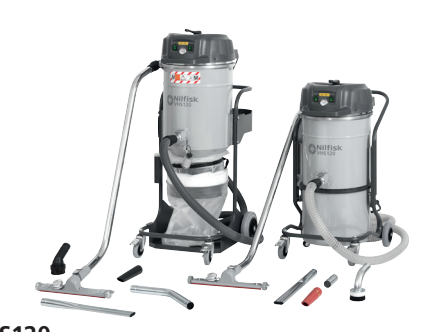
VHS120 The VHS120 is the ideal vacuum cleaner when there is need of high performances in compact dimensions for collecting any type of waste material.