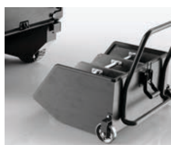
Wheeled hopper with optional mini containers